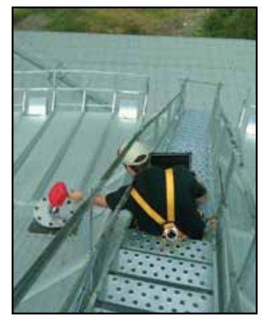
Most big bins have a single ladder from the sidewall to the peak for bin access.