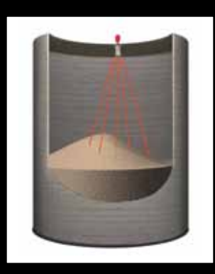
A single scanner measures in a 70° beam angle that does not cover the entire surface area.

The BinMaster MVL system synchronizes the data from one or more additional scanners to cover more material surface, which makes the volume estimate more accurate. The controller is programmed to combine the data from the scanners and map the measurement points that are depicted in a visual representation of the material surface.