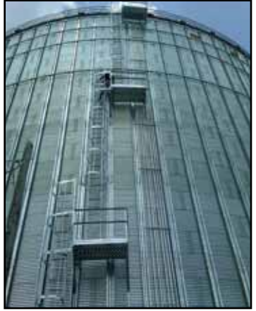
The BinMaster MVL eliminates the need to climb ladders to check levels.